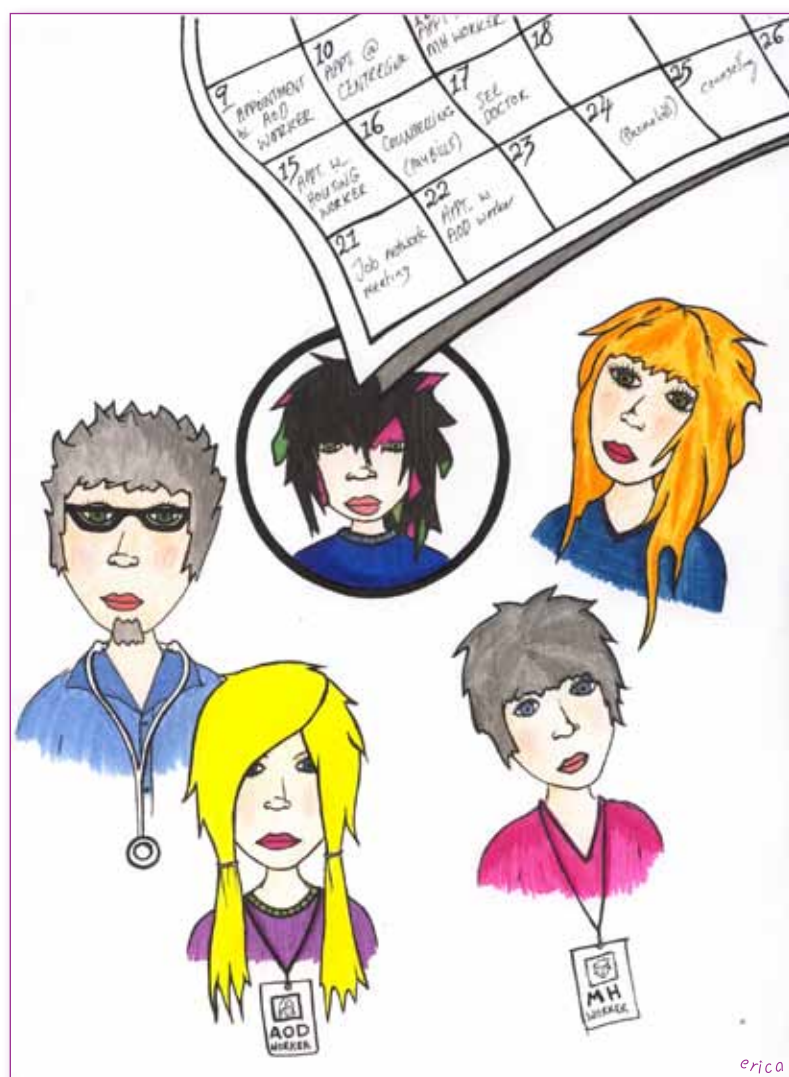
“Another day, another worker” depicts a confused young person with a full calendar juggling appointments with different workers from different professions.

When I was 18, I got $9000 compo because my dad used to hit me. I blew all the money in two months though. They were crazy to have given me that much money all at once. $4000 of it went on drugs. I got a laptop, a car, a slab every day, and choof. (Participant 23) ❖